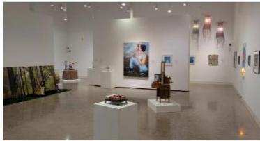
Pictured: 103rd Annual Spring Show