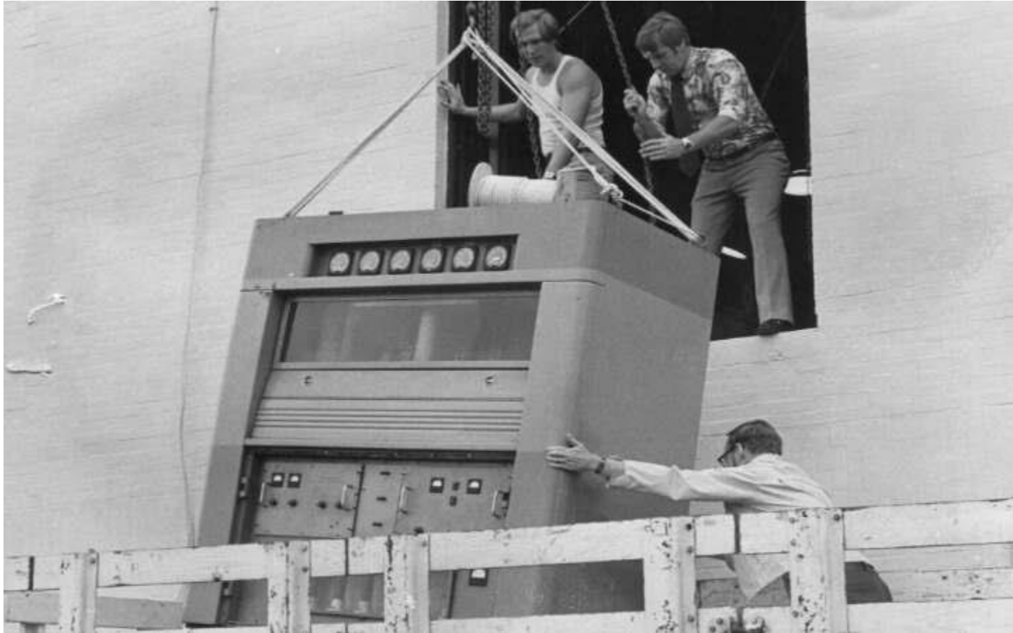
WERG in the 1970's: "new" transmitter being installed in the Nash Library

Many of you know that from as far back as I could remember, radio was where I wanted to be when I grew up. I also wanted a college education, so by the time I got to my junior year in high school, I started looking for colleges/universities with a degree in something related to broadcasting/communication.